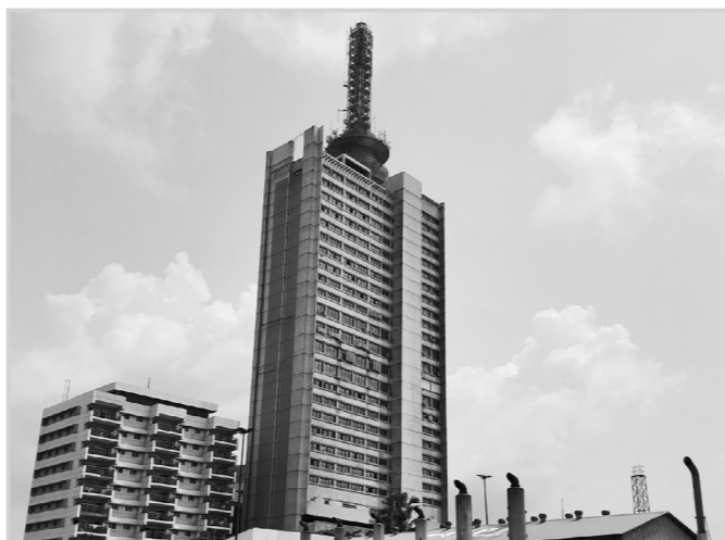
Post Colonial Style of Architecture Post-colonial Era