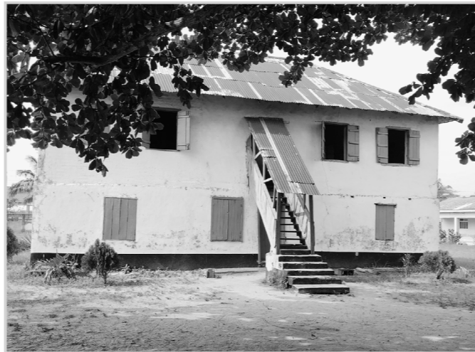
Colonial Style of Architecture Colonial Era